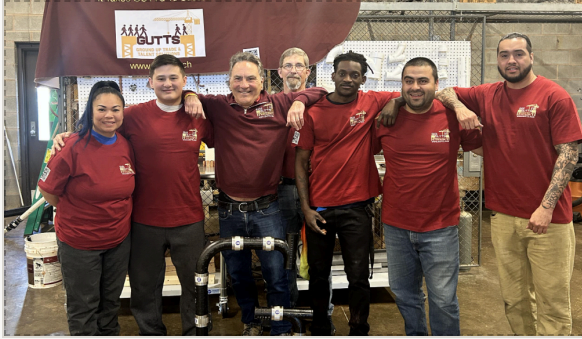
THE GUTTS CREW · "IT TAKES GUTTS TO SUCCEED"

At Ground Up Trade & Talent Solutions, we train entry-level talent and connect them with quality employers across the skilled trades. Our mission: build economic and career opportunity that keeps the trades strong.