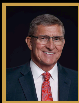
LIEUTENANT GENERAL (RET.) MICHAEL FLYNN GLIS Chairman