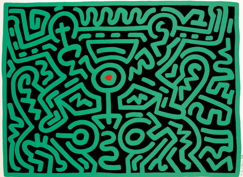
Keith Haring, Growing, 1988 #3, unique trial-proof hand-signed screenprint

Martin Lawrence Galleries currently has on loan three spectacular works from our Haring collection to the Haring Exhibition at the Tate Liverpool. The works will then travel to The Center for Fine Arts (Bozar) in Brussels, followed by Museum Folkwang, Essen.