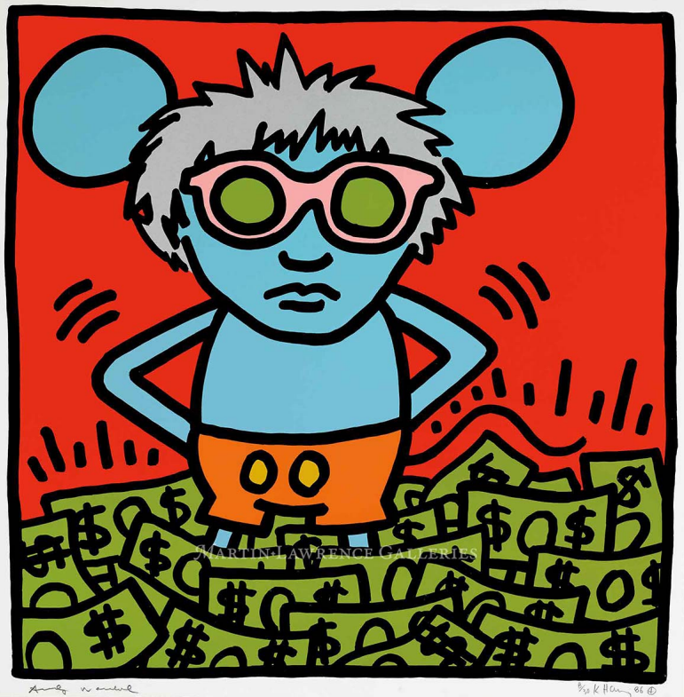
Keith Haring, Andy Mouse, 1986 (#1), hand-signed silkscreen