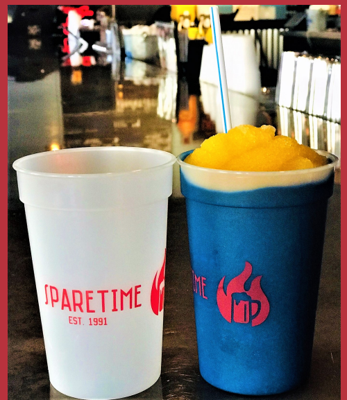
SPARETIME SLUSHIES IN SOUVENIR CUP

Consuming raw or under-cooked meats, poultry, seafood or eggs may increase the risk of food-borne illness