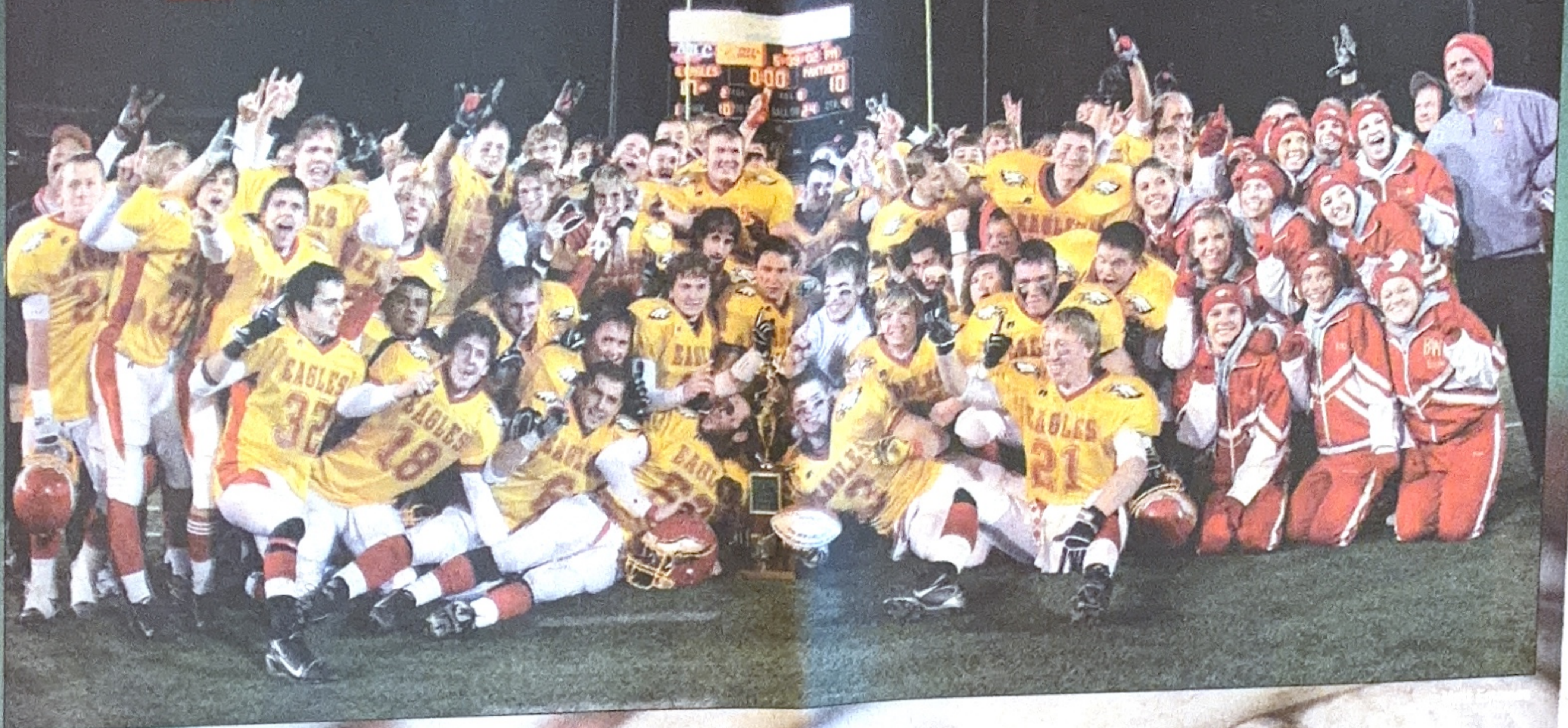
The Eagles celebrate after capturing the Division III crown in Canton.