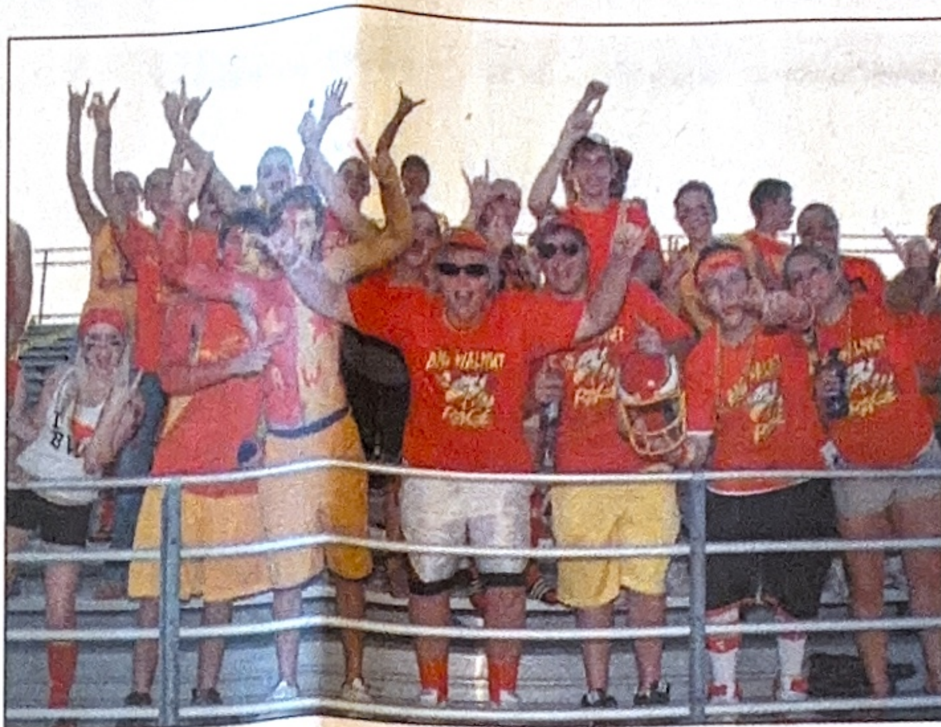
Golden Eagles fans celebrate at the season opener.

Big Walnut's offense, which piled up 2346 yards and 20 first