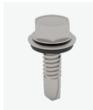
Self-drilling Screw X 40