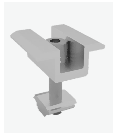
Middle Clamp X 6