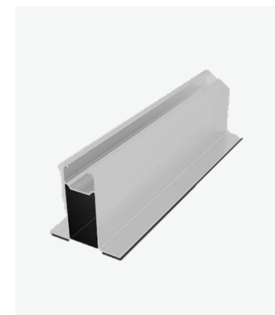
Mini Rail X 10