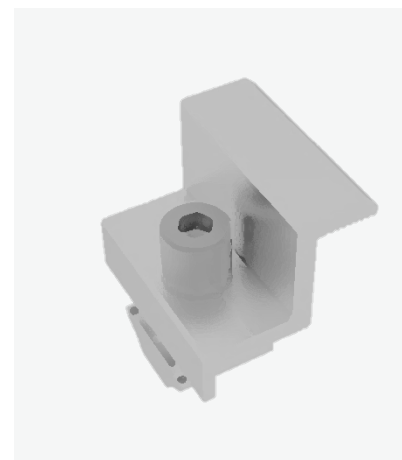
End Clamp X 4