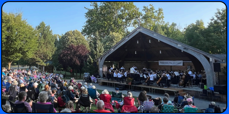
Sponsored by Hollidaysburg Area Arts Council and the Wolf-Kuhn Foundation