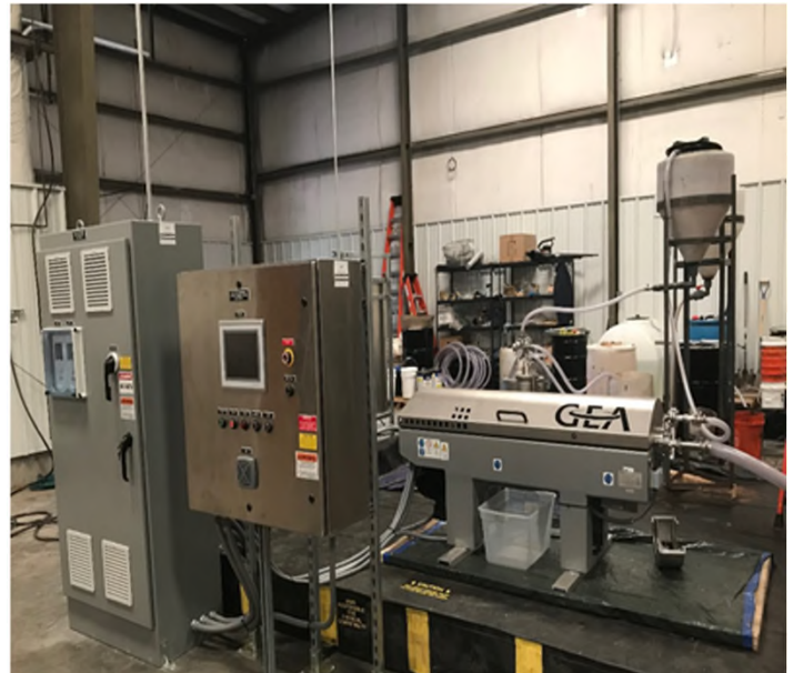
Extrakt Pilot Plant for the TNS™ Technology Demonstration (Bowling Green – Kentucky, USA)